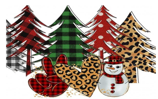
Peace. Love. Snowman