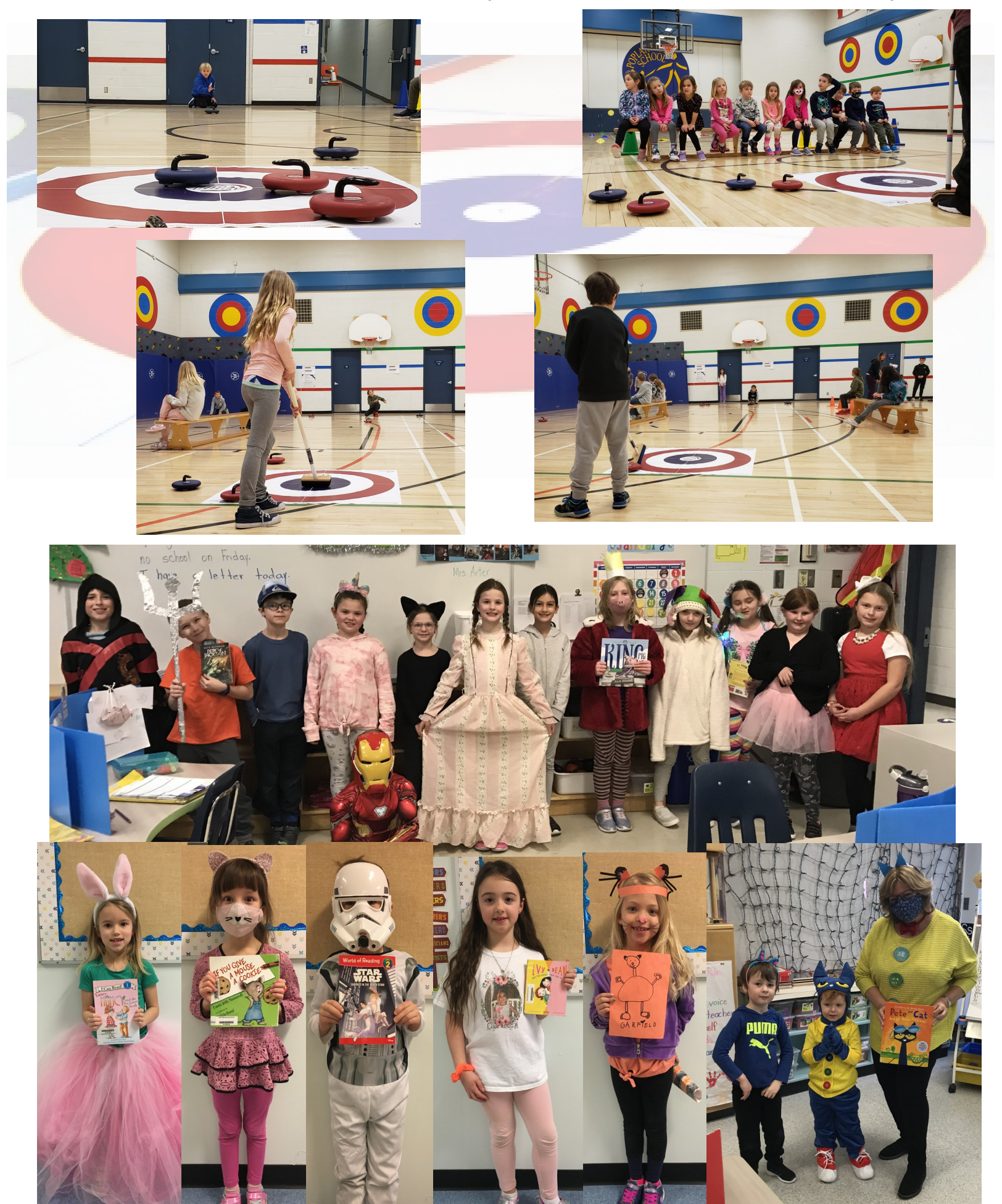
Here's what we've been up to in the month of January.